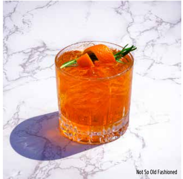
Not So Old Fashioned