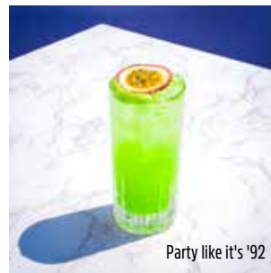
Party like it's '92